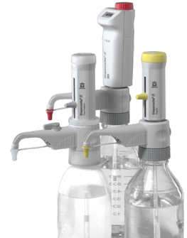
Dispensette® S Bottletop Dispenser