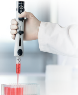
PD-Tip II Precision Dispenser tips and HandyStep® S Repeating Pipette