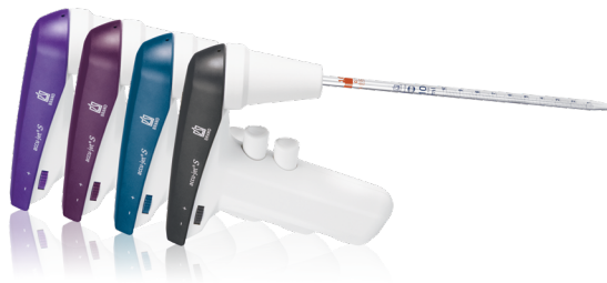
accu-jet® S Pipette Controller