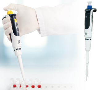
Transferpette® S Single Channel Pipette

Buy 3 BRAND® pipettes or dispensers and get a 4th of equal or lesser value for FREE.*