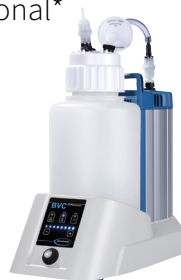
BVC Professional Fluid Aspiration System