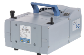
VACUUBRAND® vacuum pump or system