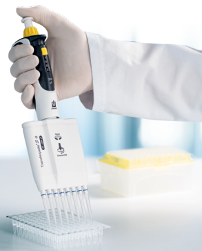
Transferpette S Multichannel Pipettes